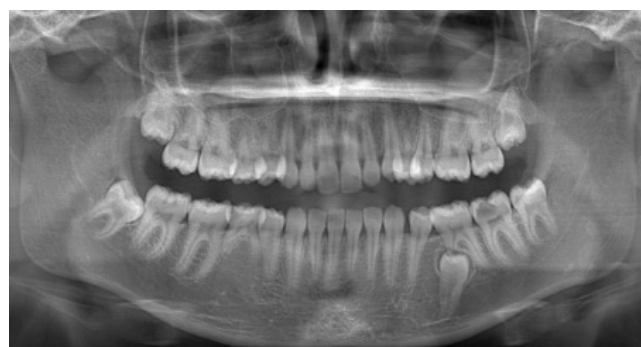
Figure 1. A case sample demonstrating root resorption in a mandibular first molar and impacted lower left second premolar